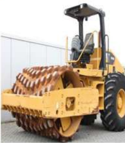
Roller Single Drum