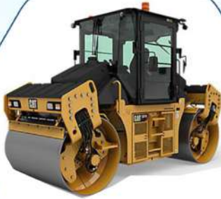
Roller, CD10 SOLID DRUM

The construction section is the largest of the group and operates as a construction contractor in Somalia. With a vision to provide quality construction engineering services and equipped with the necessary machinery and expertise to deal with multi-million dollar projects, RSC Limited has been awarded and has implemented successfully a number of high profile projects. Our Construction service include Construction Project Management, Architectural Engineering & Structural Engineering.