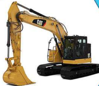
Excavator: CAT 325F