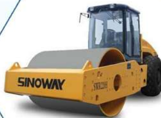
Drum Roller: 1 No. available with a compaction weight of 18 tonnes.